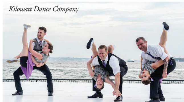
Kilowatt Dance Company