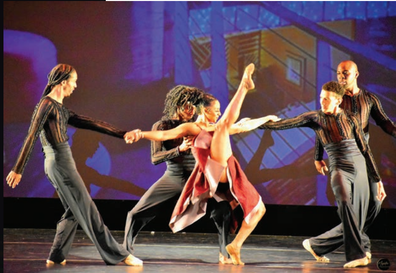
Atlanta Dance Connection

events, held throughout the year, draw together preeminent dance professionals, choreographers, and educators committed to celebrating and preserving dance as an art form in all its profound complexity and transcendent beauty. At AIDF, we believe that everyone has a place on the stage.”