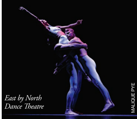
East by North Dance Theatre