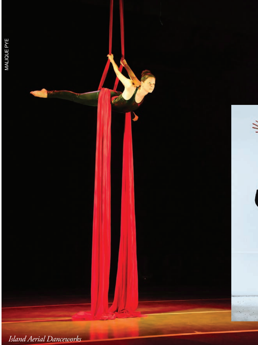
Island Aerial Danceworks