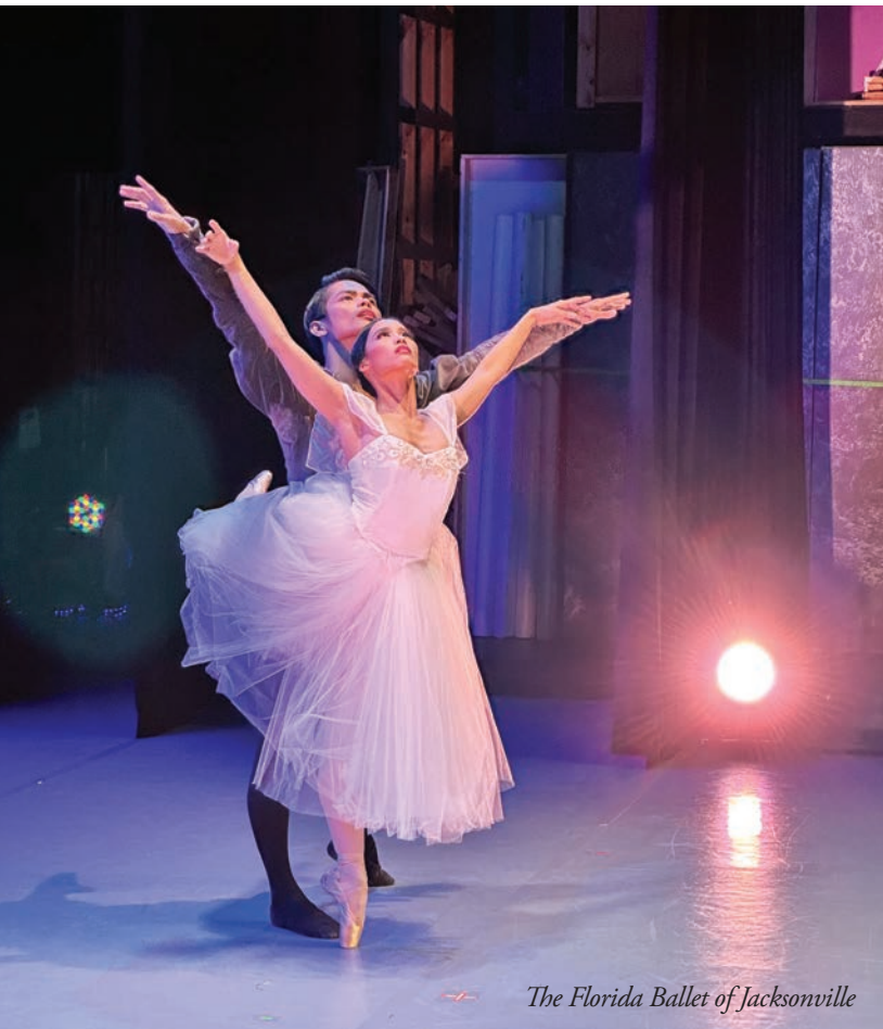
The Florida Ballet of Jacksonville